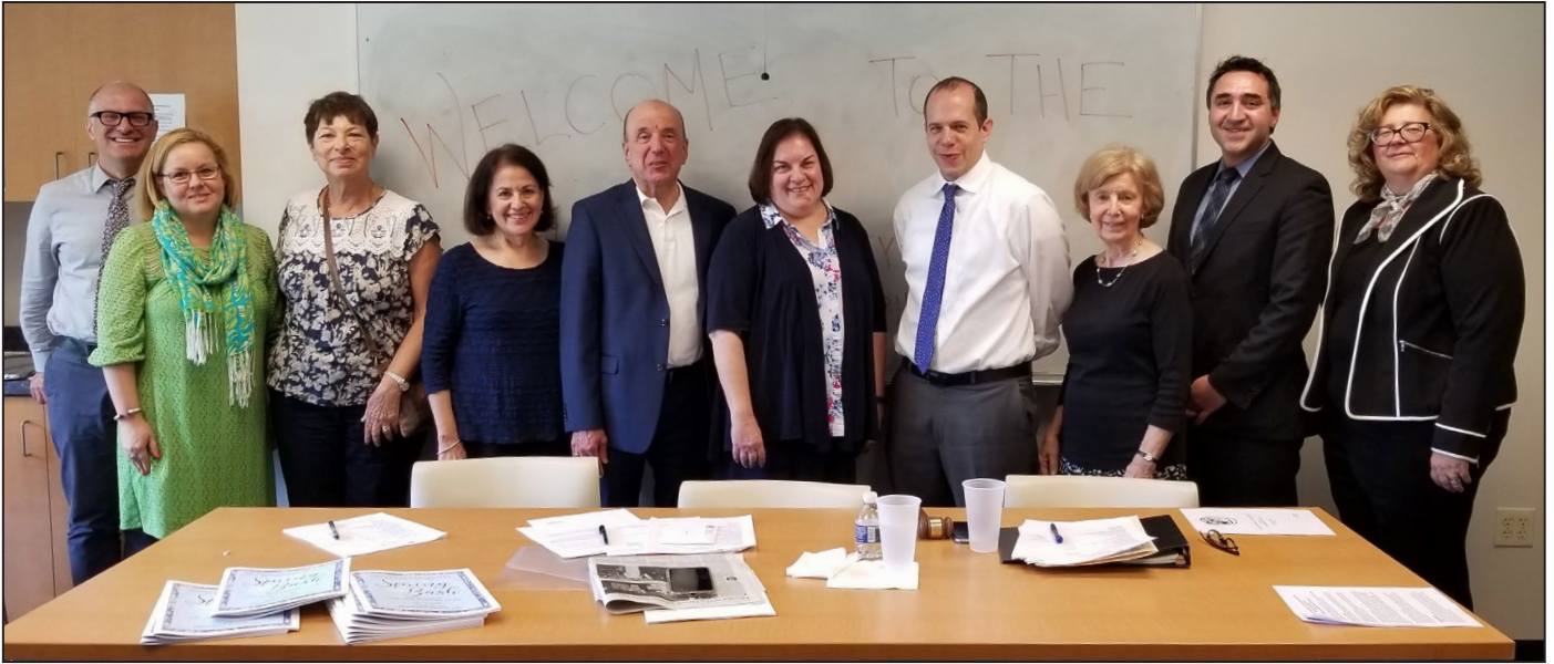
2019-2020 HUC Board of Directors and Committee Chairs.